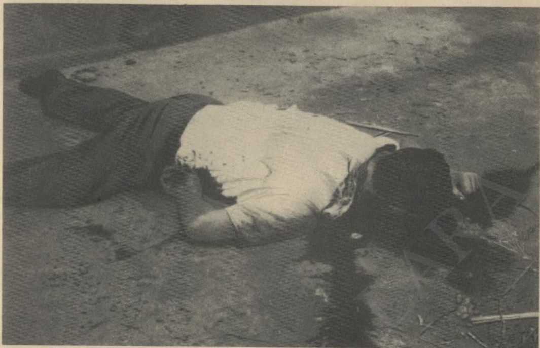
White settler bush-knifed to death.