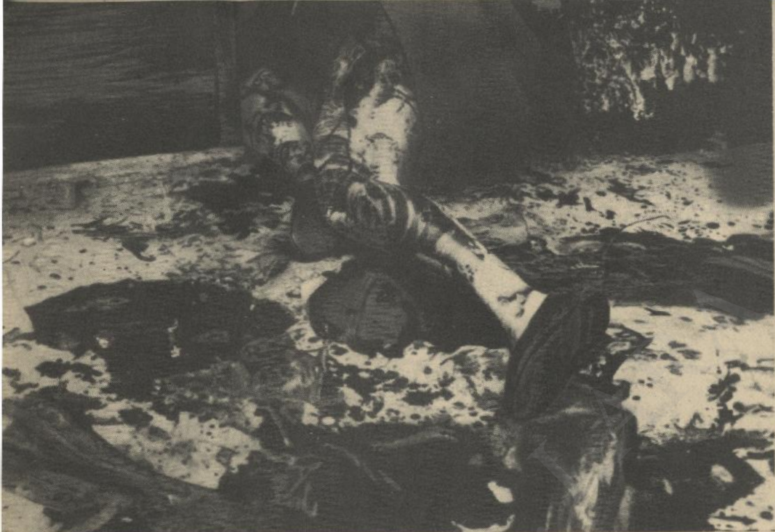
Human remains found after a Terrorist attack.