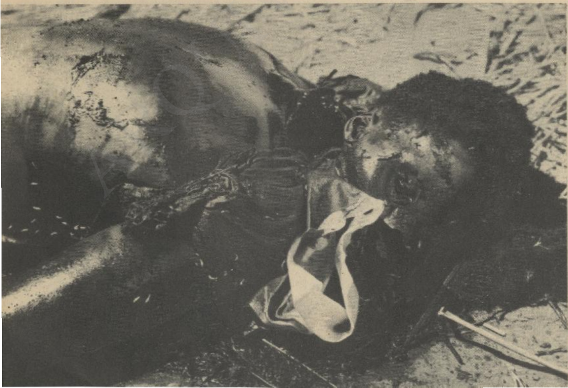
Horribly mutilated Portuguese negro whose eyes were plucked out while he was still alive.