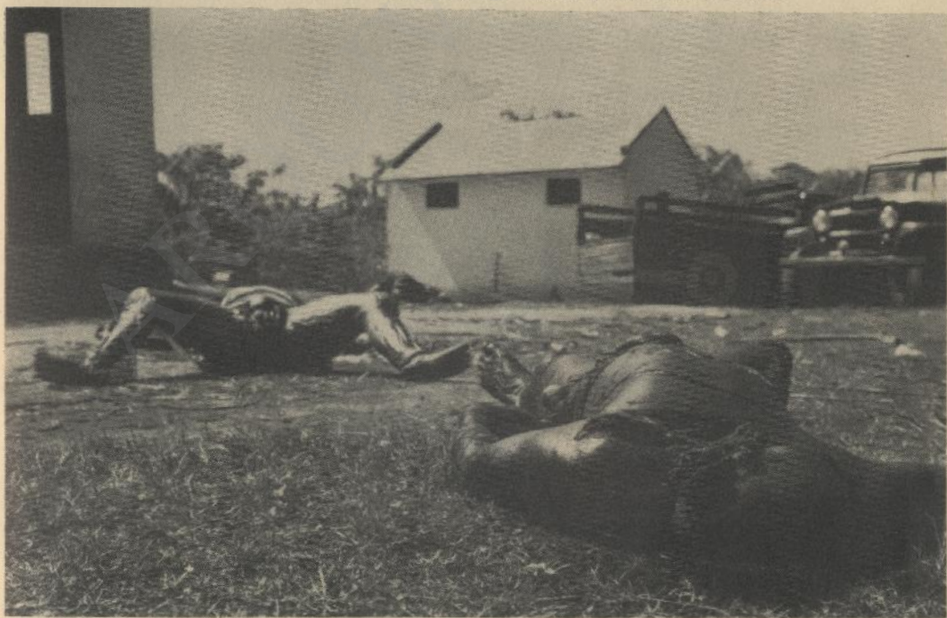
Angolan native victims of Terrorist barbarities.