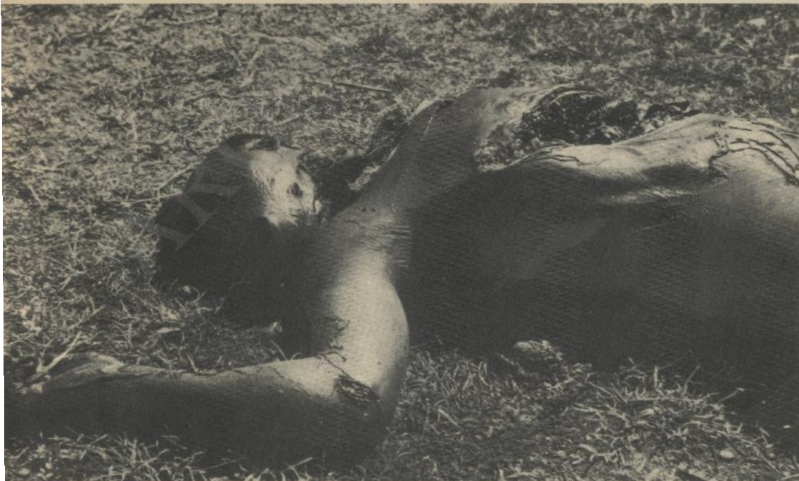
A Portuguese negro, disembowelled and decapitated.