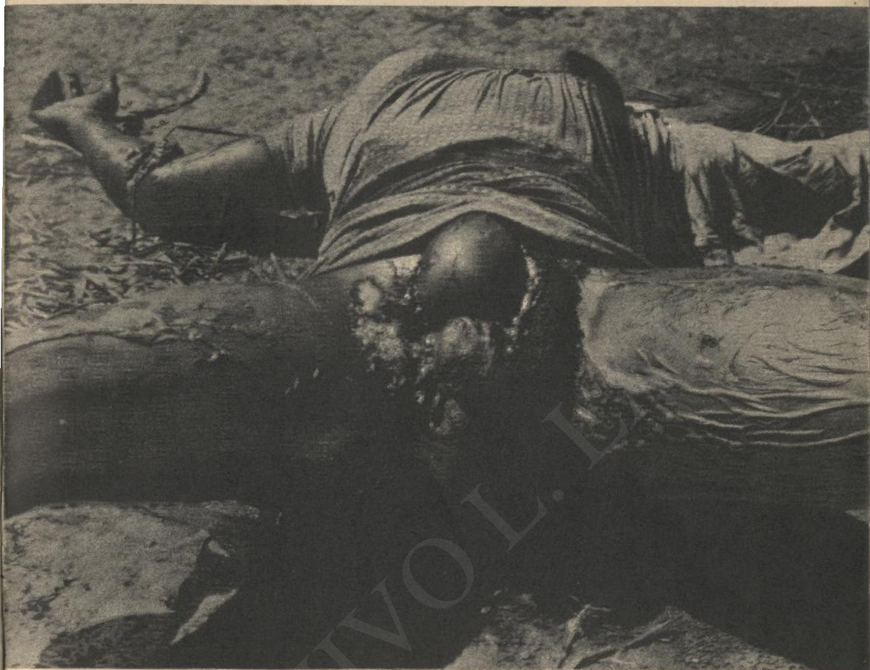
Native woman, butchered to death with horrible cruelty.