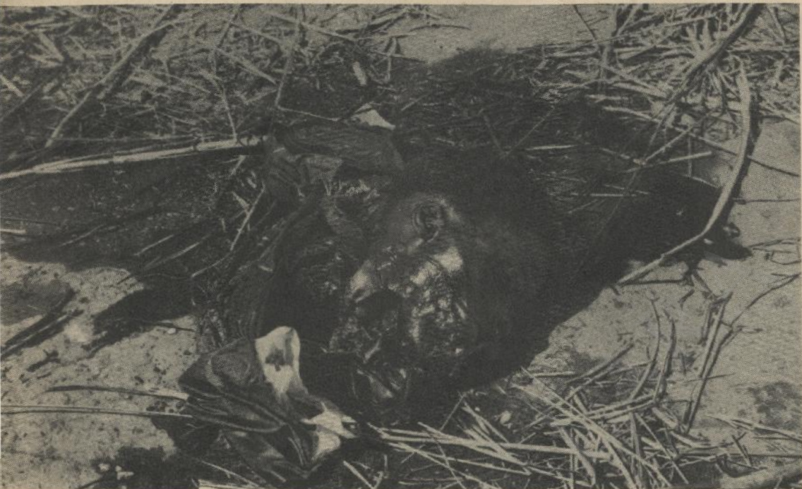
Horribly mutilated Portuguese native.