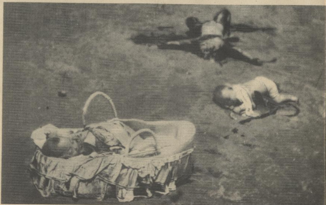
Bush-knifed children lying near their decapitated negro nursemaid.