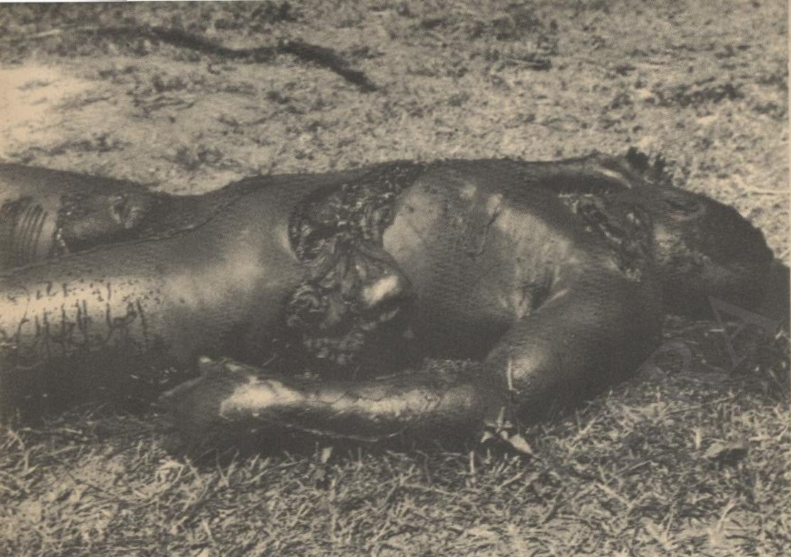
Coloured Portuguese assassinated with a bush-knife.