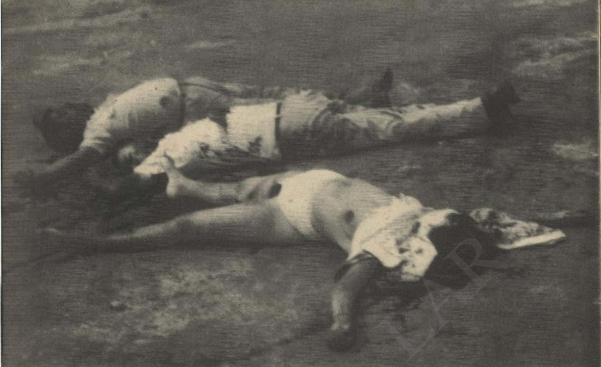
Whites assassinated after a woman had been raped.