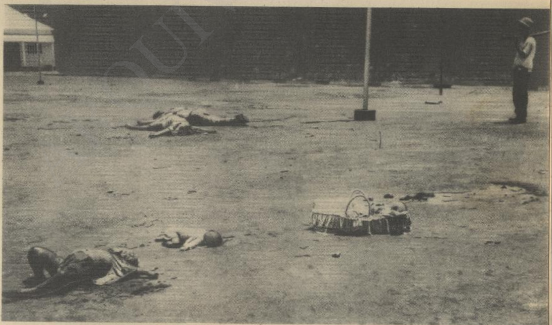
Bush-knifed children lying near their decapitated negro nursemaid.