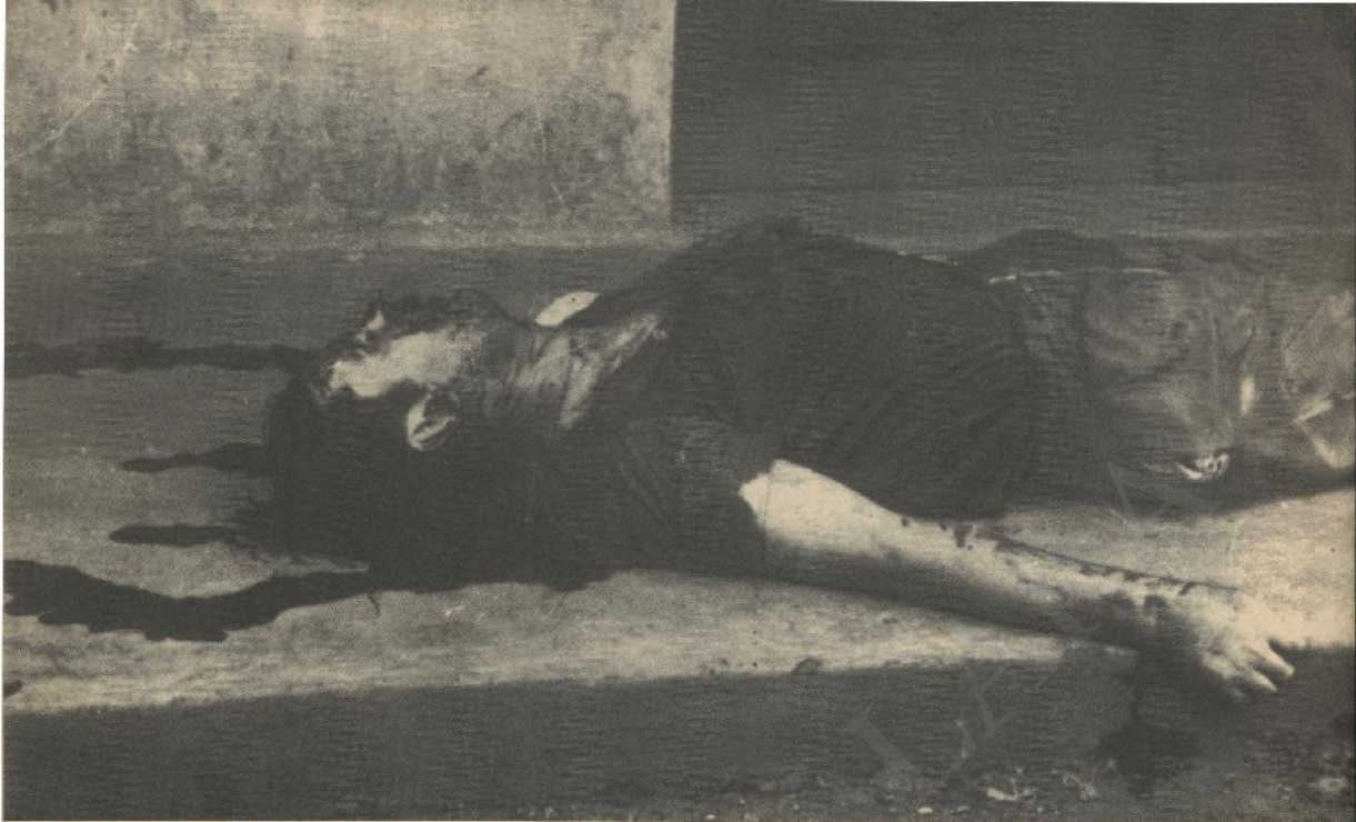
White settler assassinated near Carmona during a Terrorist attack.