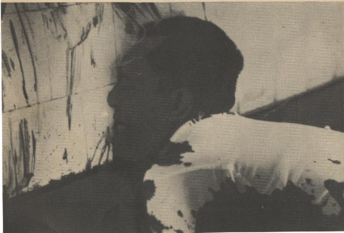
Angolan journalist, found assassinated in this position.