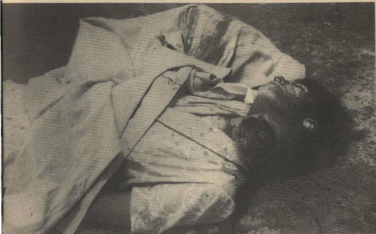
White woman decapitated during an attack on Quitze.